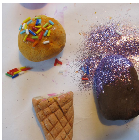
STEP 8: Use PVA glue to add glitter and bead sprinkles.