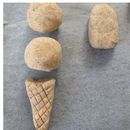
STEP 6: Arrange your salt dough creations on the baking paper/tray and cook for 2.5 hours. Allow to cool completely.