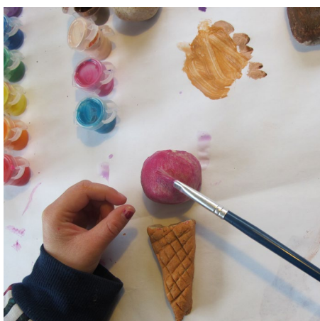
STEP 7: Once cooled, paint each piece.