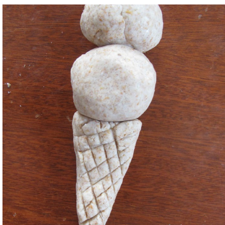
STEP 4: Use a blunt knife to make a waffle pattern on the ice cream cone.